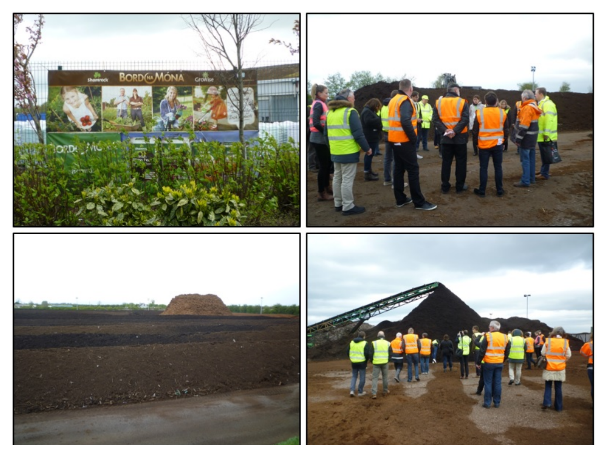
Site visit to Bord na Mona, a composting and automated bagging facility for peat based products, located in Kilbery Co. Kildare.

Exhibitors included Dorset Green Machine; Vogelsang; Novamont; Weltec Biopower; Nova Q; Environmental Technology Resources; Menart; Enviroguide; Air Liquide and MacMachinery. Glabal Organic Repayrces Congress, 314th/of May 2016/