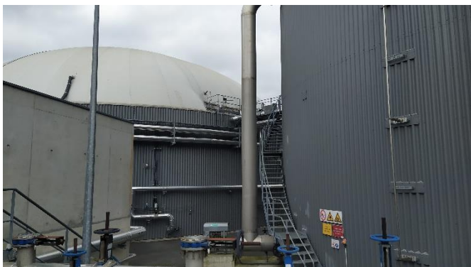
Cooperl site visit: anaerobic digesters