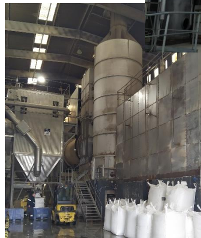
Cooperl site visit: digestate processing, organo-mineral fertiliser production from manure and animal by-products.