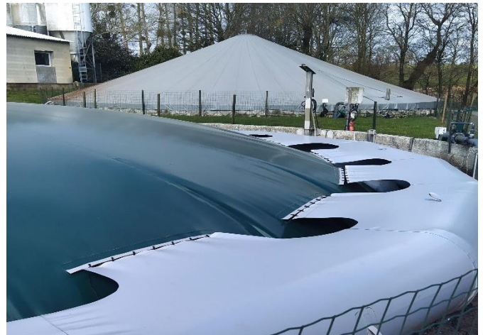
Couiclang pig farm site visit: covered manure storage with biogas collection

Workshop participants also visited the Couiclang pig farm, located in Plene Jugon and operated by Bernard Rouxel, the chairman of Cooperl, with 4 employees. The farm houses 500 sows in a breeder-finisher model and employs an advanced manure management system, including V-shaped slatted floor scraping , for half of the production. The liquid part is treated with the slurry on site. From this system, the solid part is transported from the farm for biogas production.