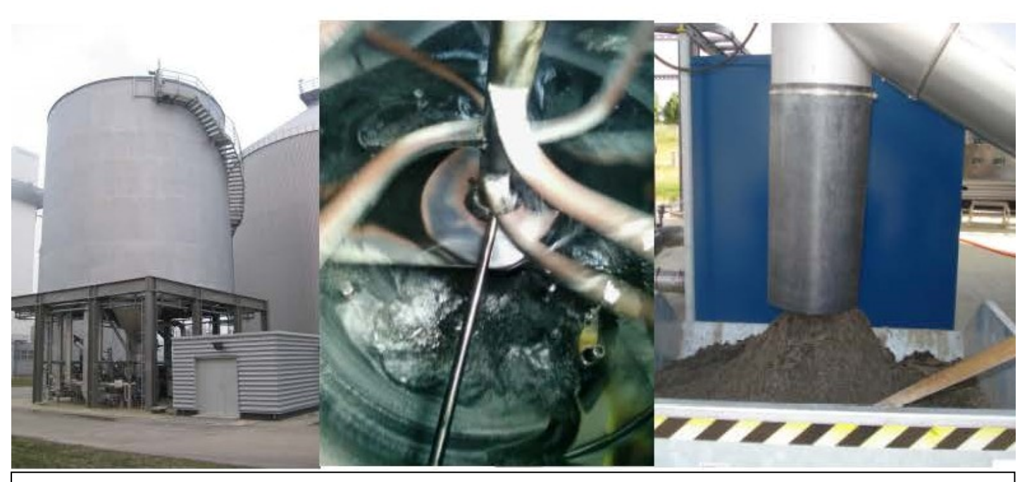
Struvite washing installation

A 45-litre, cylindrical reactor was tested, with an inner cylindrical zone mixed by air upflow, with a settling zone between this inner cylinder and the outer cylinder. In particular, reaction conditions and residence time in the reactor were shown to be important for achieving appropriate struvite particle