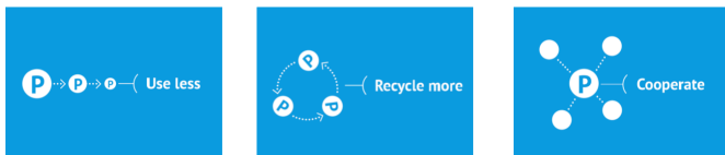
Avenues towards sustainable phosphorus management

In order not to lose the momentum of first European Sustainable Phosphorus Conference, actions will already be engaged during the interim period to move forward the platform's objectives including network building, communications, technical meetings and supporting national/local value chain structuring. Please see the interim action plan for more information.