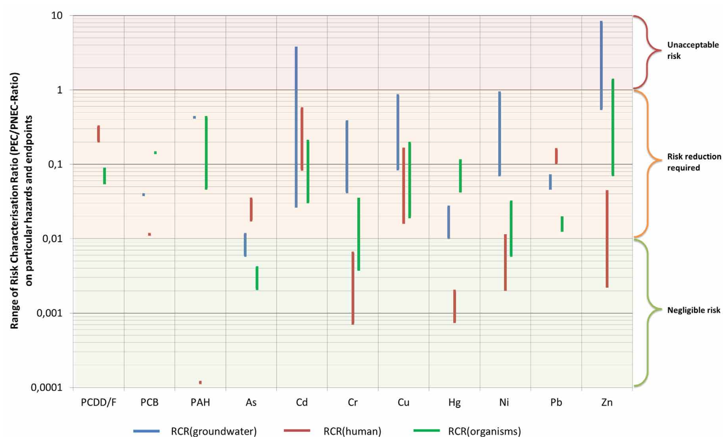
Fig. 4: Range of Risk Characterization Ratios (PEC/PNEC-Ratios) on particular hazards and endpoints