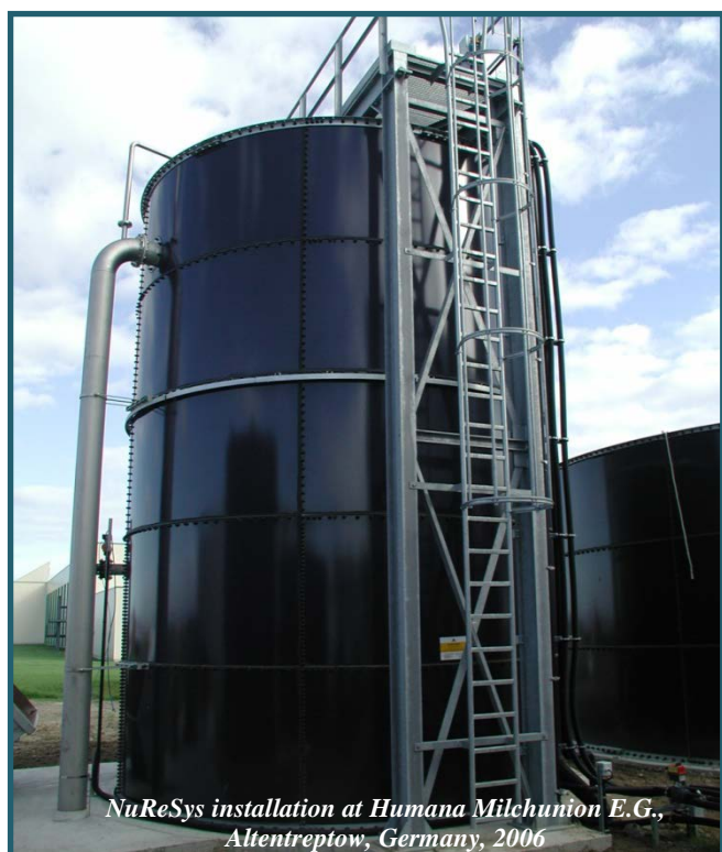
NuReSys installation at Humana Milchwurk E.G., Altentreptow, Germany, 2006

ESPP member, NuReSys (Nutrient Recovery Systems) installed their first struvite recovery installation in 2006, and now have ten plants now operating in four different countries (Germany, Belgium, The Netherlands, Italy).