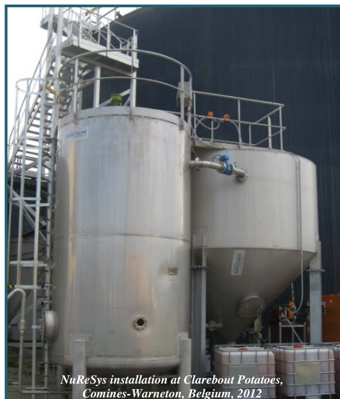
NuReSys installation at Clarebout Potatoes, Comines-Warneton, Belgium, 2012